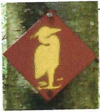
Red/yellow trail marker